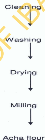
Figure 2. Flow diagram of acha flour preparation