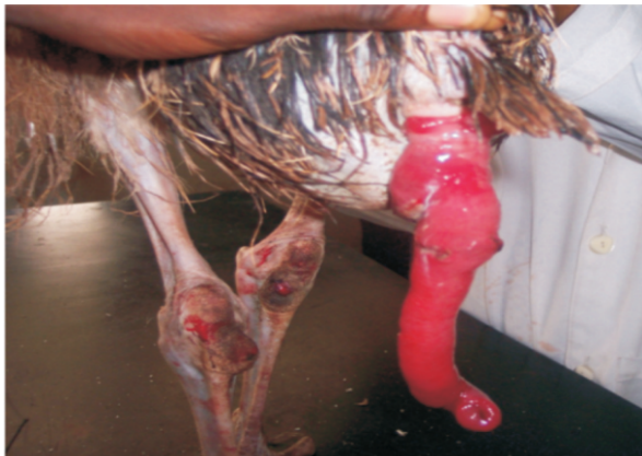
Figure 1: Emu showing prolapsed intestine